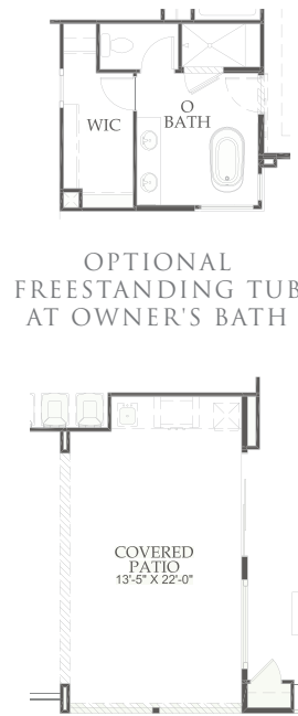
OUTDOOR KITCHEN OPTION