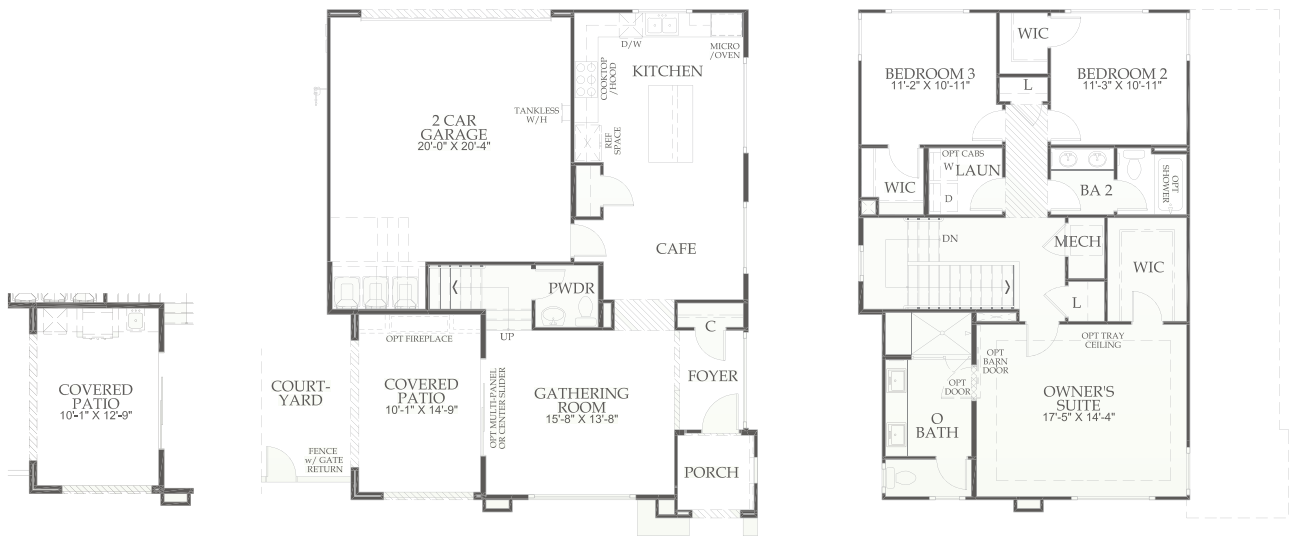
OUTDOOR KITCHEN OPTION

2,424 sq. ft. | 3 Beds | 2 Baths and 2 half baths | 2-Car Garage | Bonus room | Covered balcony | Three-story