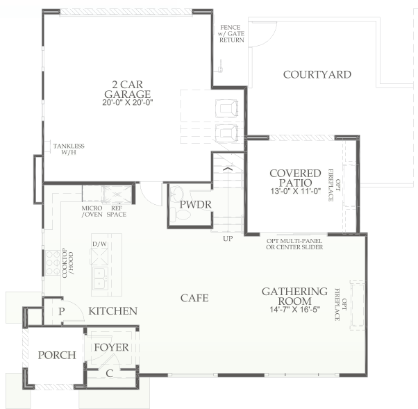
FIRST STORY (COMMON TO 2- AND 3-STORY PLANS)

2,297 sq. ft. | 3 Beds | 2.5 Baths and 2 half baths | Bonus room | Covered balcony | Three-story