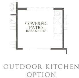
OUTDOOR KITCHEN OPTION