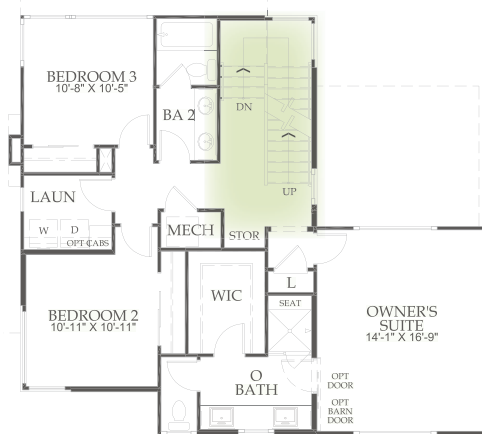
ALTERNATE SECOND STORY (STAIR CONFIGURATION)

2,297 sq. ft. | 3 Beds | 2.5 Baths and 2 half baths | Bonus room | Covered balcony | Three-story